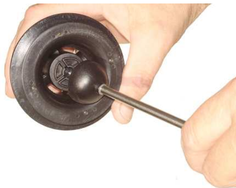
Pull gently on the shaft to separate the dome connector from the aeration pump.

Please note the male cross section inside the dome connector and the mating female cross section on the aeration pump.