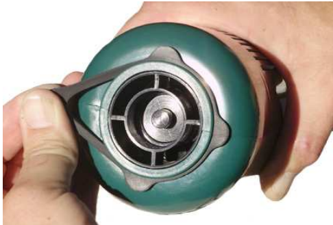
Remove the rubber closure ring

Before you brew the first batch, it is recommended that you take the BioBlender apart and familiarize yourself with the moving parts inside before they are covered with “bioslime”. (The bioslime is the by-product from brewing a healthy and energetic batch of SoilSoup) It is full of beneficial microbes!