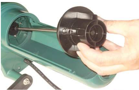
Gently lift the black plastic aeration pump and pull the shaft away from the motor coupling.