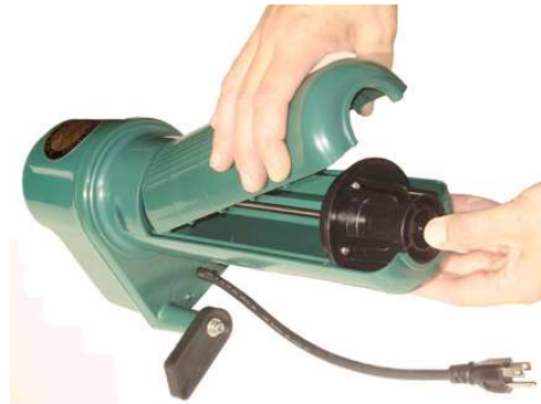
Lift in the front and remove the slotted cover